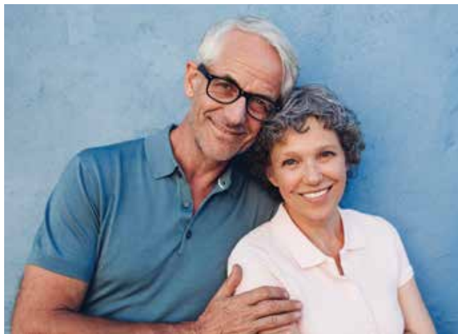
Joint Life Male, age 67 | Female,age 67

Joint to Spouse: 100% payment guaranteed until both deaths